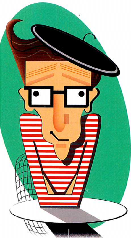
Woody Allen in Cannes