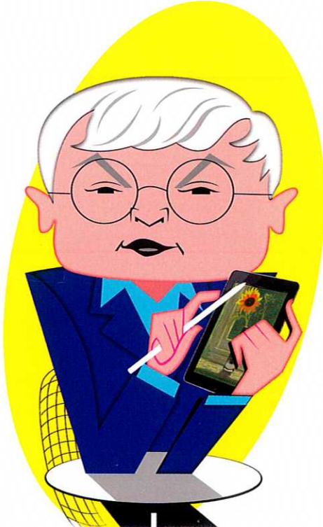
David Hockney's iMasterpieces