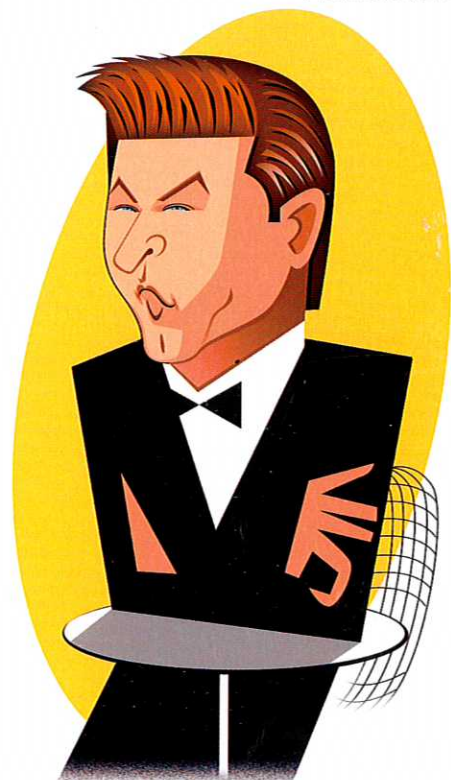
Alec Baldwin Loves NYC