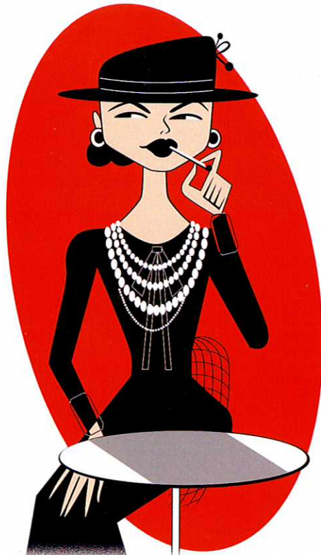
Coco Chanel Strikes Gold