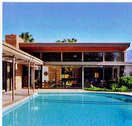
The Frank Sinatra Twin Palms Estate

from a rumored dispute involving Lana Turner, his then-wife Ava Gardner and a bottle of whiskey. The piano-shaped pool, however, is in perfect condition. The home is now available to rent and comes with a concierge, who will arrange anything from a chef to a security guard. From $2,600 per night; 760-318-2090; beaumontvillas.com.