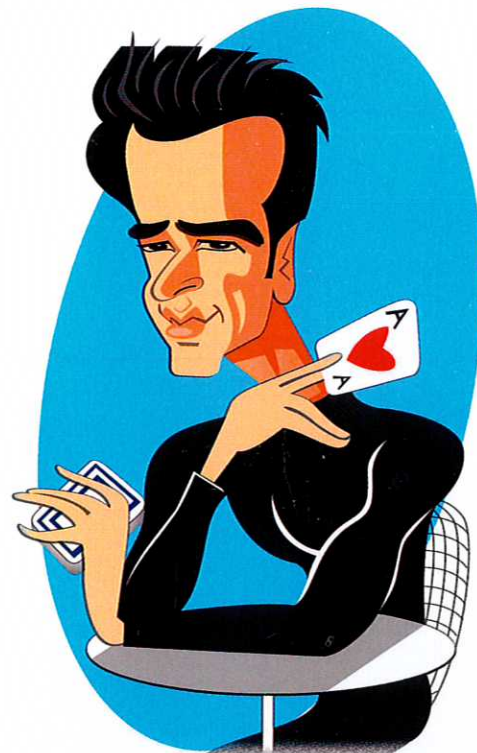
David Copperfield's Caribbean Magic...and more ►