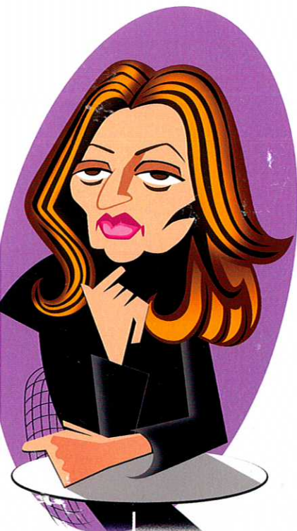
Zaha Hadid's Chinese Opera House