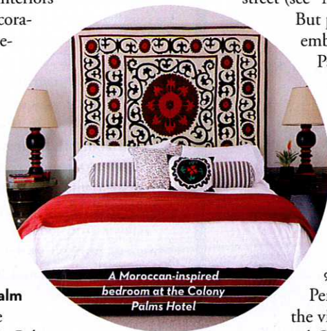
A Moroccan-inspired bedroom at the Colony Palms Hotel

Nestled next to the Palm Springs Art Museum, the often overlooked Willows Historic Palm Springs Inn (rooms, from $295; 412 W. Tahquitz Canyon Way; 760-320-0771; thewillowspalmsprings.com) is the thinking man's boutique hotel. An eight-bedroom Mediterranean villa built in 1924, this is where Albert Einstein frequently visited and Clark Gable and Carole Lombard stayed on their honeymoon. In the mid-'90s, the house was restored into a B&B in archly opulent old Hollywood style. The bedrooms are filled with antique