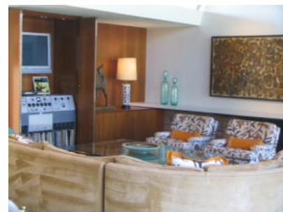
Sinatra's desert retreat: Living area with original recording equipment

Considering how big Sinatra's life was, there is a feeling of unreality about it. The marble slab is only about 2 feet by 1 foot, with just the entertainer's name and dates, and underneath the inscription "Beloved Husband and Father." Above is inscribed the title of one of his famous songs: "The Best is Yet to Come."